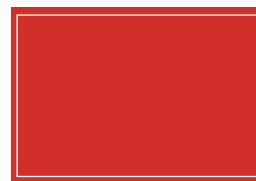
Double-page spread 1 292 D x 450 W (page trim)