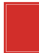
Full page 292 D x 225 W (page trim)