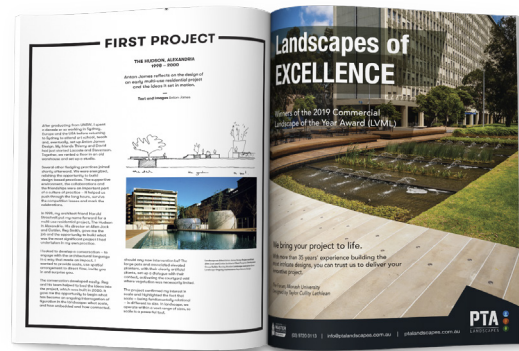
Magazine display advertising

Advertising and material supply is subject to Architecture Media's advertising terms and conditions. For more information: architecturemedia.com/media-kit .